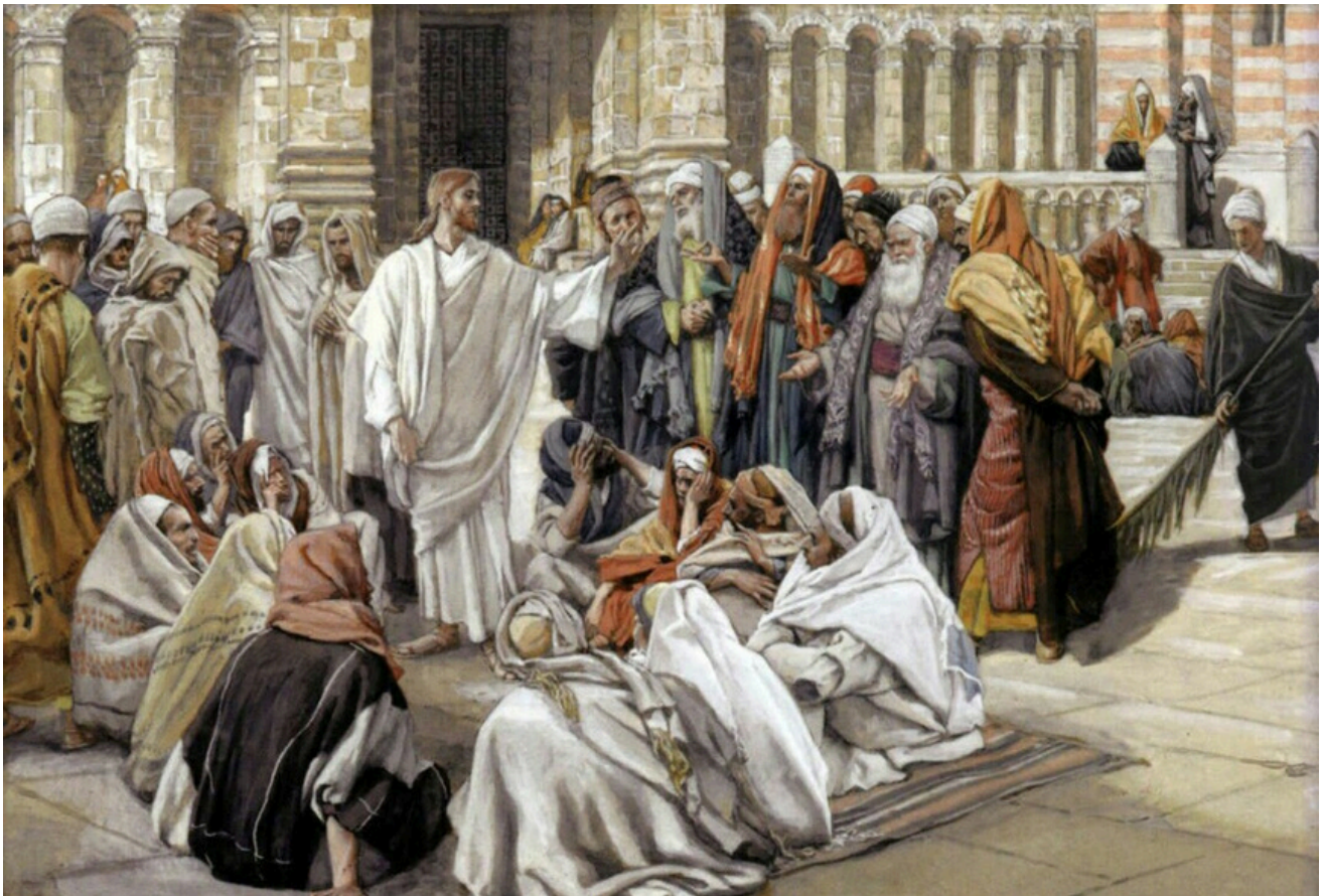
The Pharisees Question Jesus, James Tissot c.1896