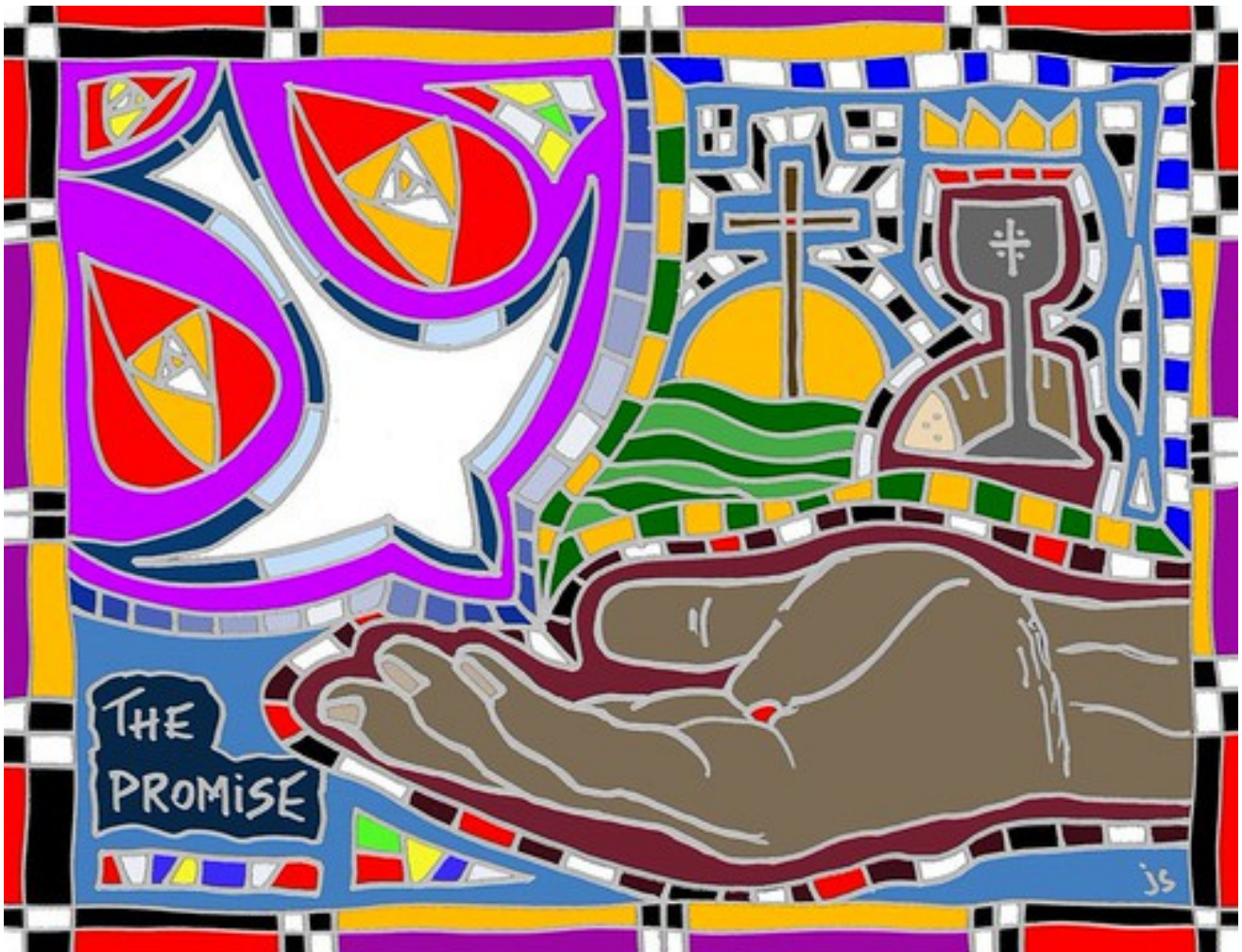
The Promise, Stushie Art